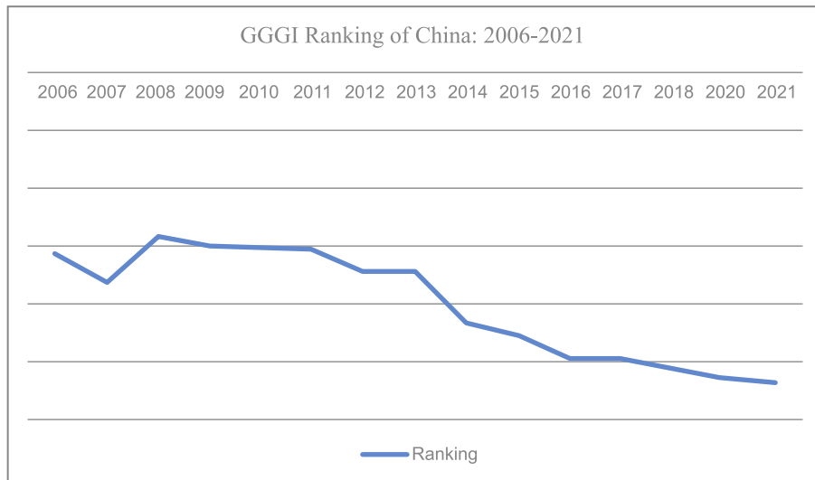
Figure 1 GGGI Ranking of China:2006-2021. Source: WEF (2006-2018, 2020-2021)