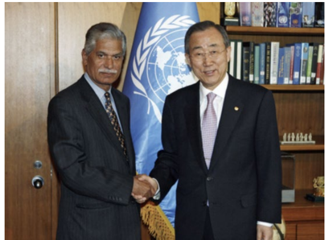
With former Secretary-General Ban Ki-moon